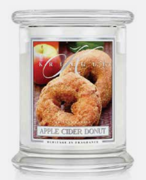
866 • APPLE CIDER DONUT Infused with spicy-sweet cider notes and a lavish dusting of sweet cinnamon. Best of all, this guilty pleasure is 100% calorie-free!

Shimmering lemon teams up with carda-mom and ginger for a zesty scent along with decadent nutmeg and baked biscotti.