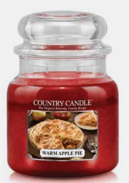
875 • WARM APPLE PIE Mouth-watering aroma with sweet apples, butter and spices straight from the oven, a La Mode!

871 • MOUNTAIN CHALET Mountain Chalet is the perfect retreat! A seasonal cozy scent with aromatic fir needle and balsam blend with smoked woos, a hint of clove, warm amber and sandalwood.