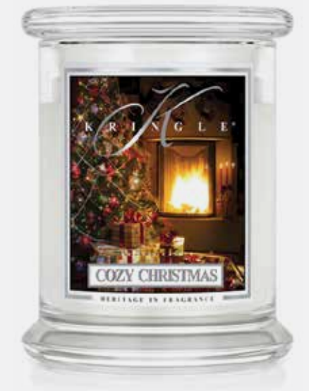
867 • COZY CHRISTMAS Warm up with this gourmand treat of hot buttered rum with clove and vanilla. All the ingredients for a Cozy Christmas!

Our Kringle Medium Classic jar candle is perfect for small to mid-sized rooms in your home and for every occasion. Features include 100% soy wax, easy-peel label, reusable jars for storage containers & recyclable. Clean, long burning (up to 65 hours) with 100% natural cotton fiber blend wicks. Highly fragrant lasting the life of the candle. 4"W x 5"H.