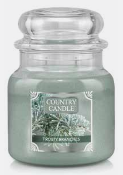
878 • FROSTY BRANCHES Images of a still and frozen orchard will come to mind as you experience the citrus notes of grapefruit and orange mingled with cedarwood and moss.

Our Country Medium size jar candle is perfect for small to mid-size rooms in your home and for every occasion. Features include our multicolor paraffin wax, easy-peel label, reusable jars for storage containers & recyclable. Clean, long burning (up to 65 - 90 hours) with 100% natural cotton fiber blend wicks. Highly fragrant lasting the life of the candle. 4"W x 5"H