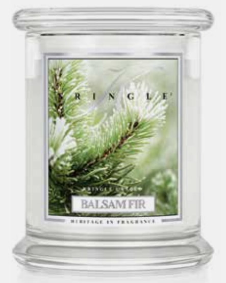
869 • BALSAM FIR Botanically-accurate woodland fragrance evoking cold winter air and fresh-cut boughs.

Shop online to support your organization at: PROFIT-RAISERS.COM