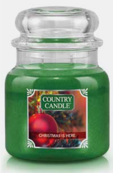
872 • CHRISTMAS IS HERE It's Christmas time! Christmas is Here and brings bright tangerine and citrus notes with lavender, cassia and eucalyptus; woodsy balsam fir, cedarwood and amber com-plete this soon-to-be holiday favorite.