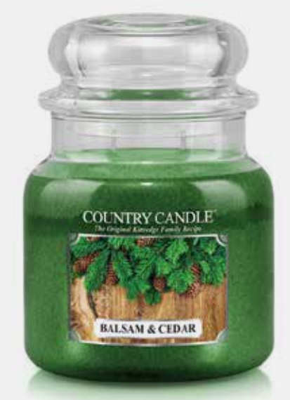
874 • BALSAM & CEDAR Beautiful balsam and earthy cedar combine for a relaxing, fresh woodlands aroma perfect year round.

Shop online to support your organization at: PROFIT-RAISERS.COM