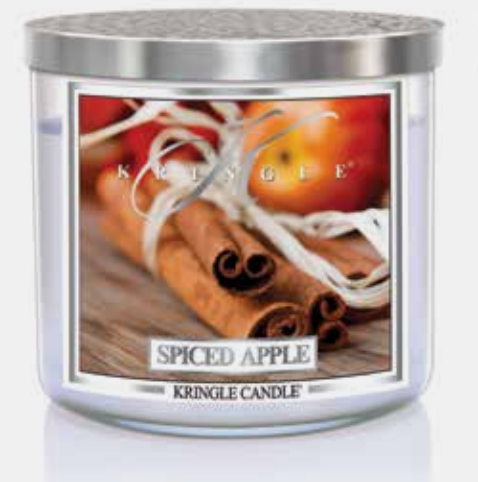
882 • SPICED APPLE Brings together bubbling baked apple, allspice, nutmeg and cinnamon notes with a gentle hint of vanilla. We were searching for the ultimate apple pie aroma and achieved a result we still can't stop enjoying.

Enjoy our 14 oz. 3-wick candles with clear glass and silver hammered lids or our unique label design collection candle tumblers. All our 3-wick candles are highly fragrant and provide up to 45+ burn time hours. This jar is a favorite for gifting!